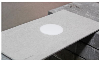
Picture 1 Initial condition of panel with FireShield