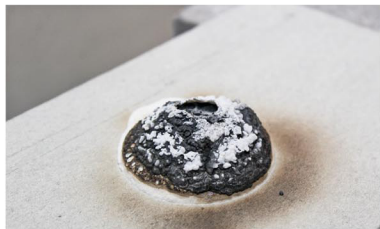
Picture 4 Final appearance of the panel after 2 hours fire exposure, FireShield prevented fire penetration to the panel.