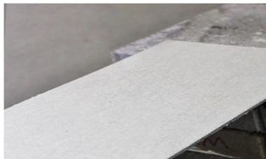
Picture 5 Back of the panel after 2 hours fire exposure, exhibits no cracking / fire spot.